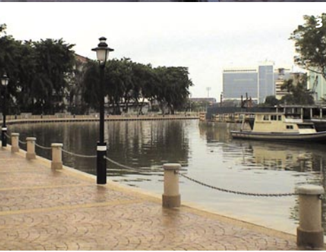
1 Night view of the rehabilitated shop houses of Jalan Laksamana, reflected on the river 2 The walkway adjacent to the shop houses of Jalan Laksamana, near the Stadthuys plaza 3 The riverfront at the Spice Garden, where the walk starts upriver from Hang Jebat Bridge